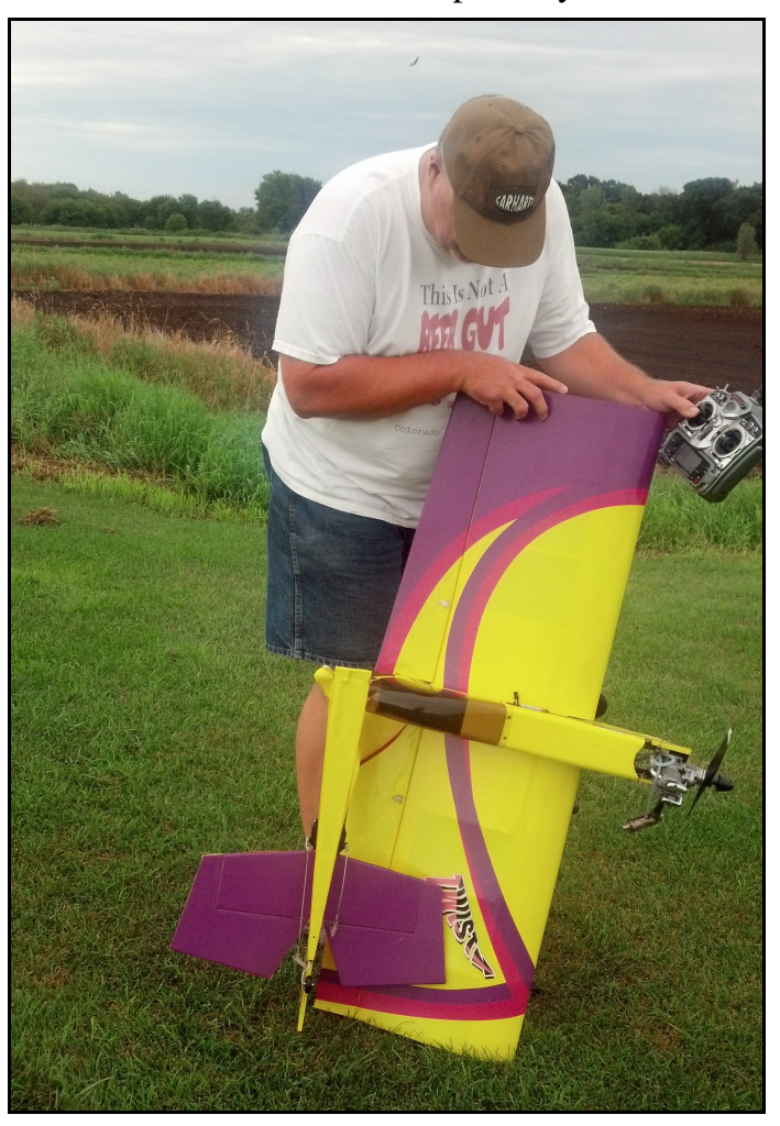
The results of Phil's Fun Fly practice session.